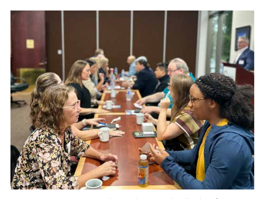
Speed Networking at London Chamber of Commerce.