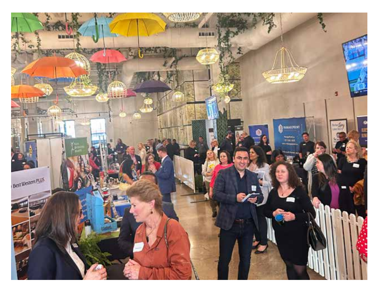
MEGA Business After 5.