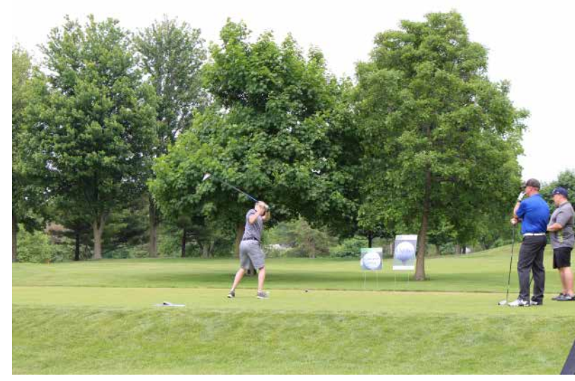
Golfers enjoying a day of golf.

ONE OF THE HIGHLIGHTS OF THE CHAMBER YEAR IS THE ANNUAL PAST CHAIRS' GOLF CLASSIC. THIS TOURNAMENT CANNOT HAPPEN WITHOUT SPONSORSHIP. THE LONDON CHAMBER IS SEEKING SPONSORSHIP INVESTMENT AT THIS TIME.